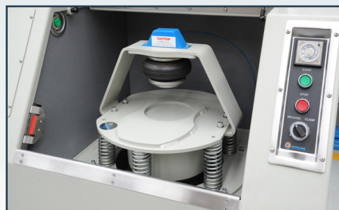
Pneumatic airbag clamp option - requires compressed air