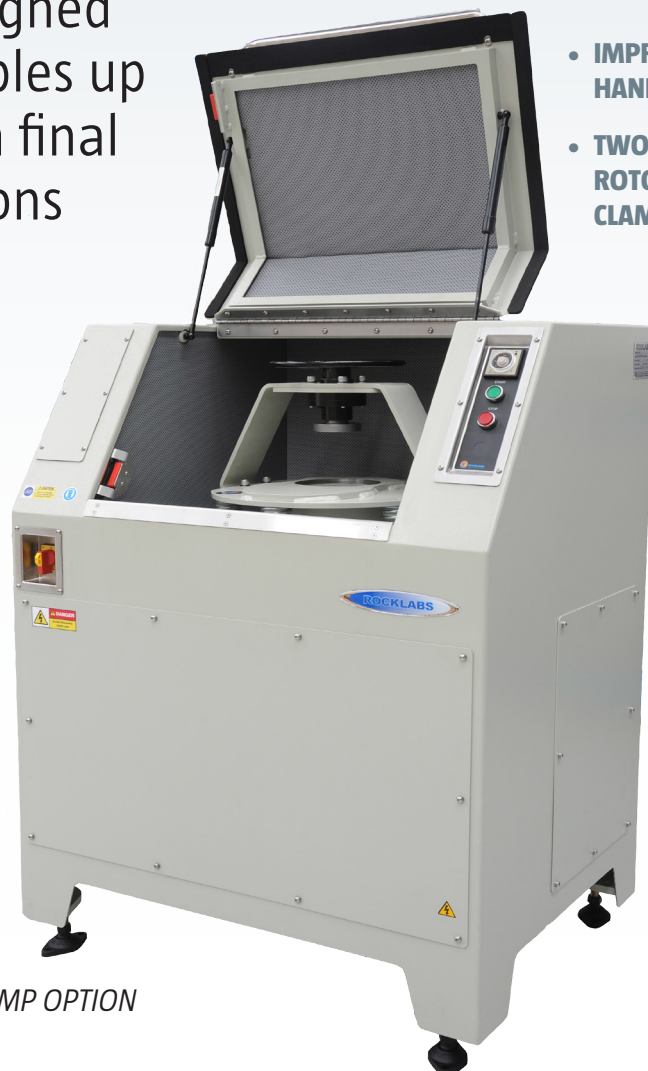
ROTO CLAMP OPTION

Reliable, safe and robust, the ROCKLABS RM1000 is designed to process samples up to 1000g with a final size of -75 microns